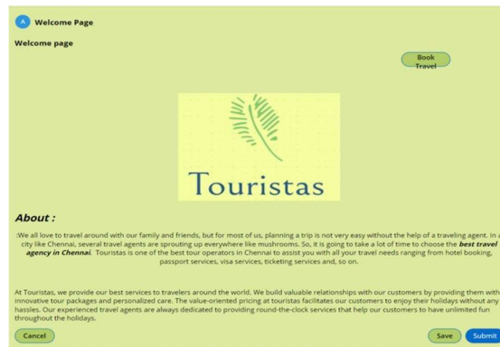
Fig. 2. Home Page

Here the Customer can select the plan they need and view the price for the travel after selecting the plan. Customers can review the plan and next step customers as shown in Figure 3 can also select the food they need.