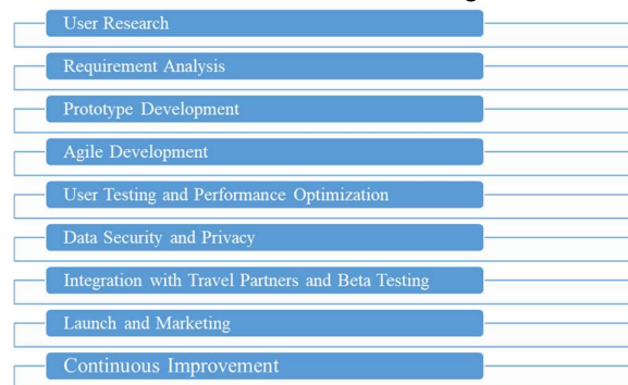
Fig. 1. Proposed Methodology

The proposed approach for enhancing the travel planning and reservations process with the Streamlined Booking Application adopts a systematic and user-centric methodology. The primary aim is to create a seamless and efficient platform that caters to the diverse needs of travelers. The research design and methods are outlined as follows: