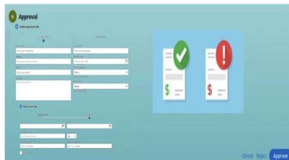
Fig. 7. Approval step